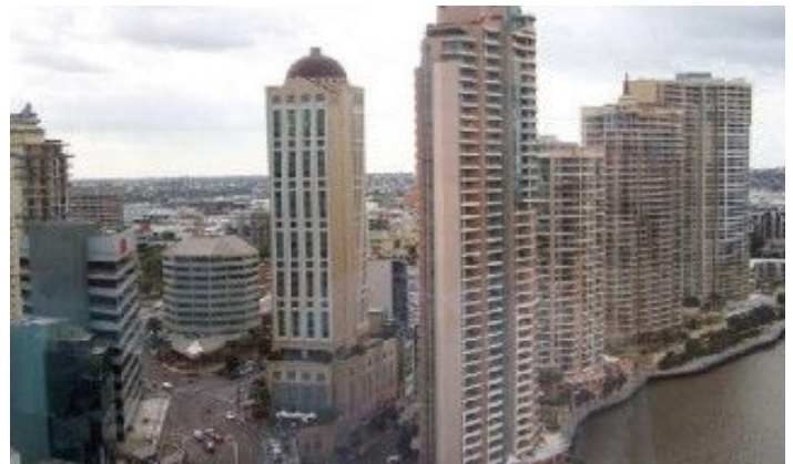
Is this the Lord Mayor's vision for West End?

There are only 6,000 people living in West End. The Lord Mayor's announcement will more